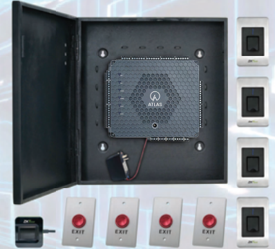
Atlas460-4 Door KIT