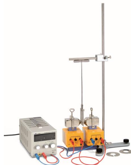
Fig. 2 Set-up Waltenhofen's pendulum