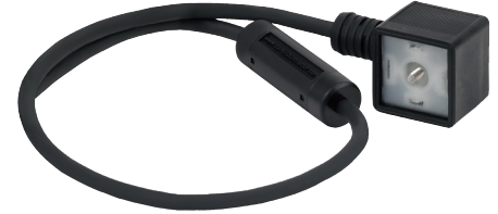
ISO, Unlighted version shown above

The Canfield Connector 5JMSD Series is a solenoid driver circuit (Coil Saver) tucked away in our in-line electronics package coupled with our 5J all-molded DIN solenoid valve connector/gasket/cord assembly for ISO DIN Style "A" EN175301-803 (Formerly DIN 43650), MINI and 9.4mm (Industry Standard) and 8mm Sub-Micro (DIN 43650 "C") connectors. The integrated gasket design boasts an IP67/NEMA 6 rating and makes it impossible to lose the gasket. The Coil Saver enhances solenoid valve function as it lowers the wattage of solenoid operators of solenoid valves as it first applies a full voltage to ensure strong pull-in then drops the current when the solenoid magnetic circuit is most efficient and lowers wattage during long term energization or repeated cycles and lower RMS wattage. The fully encapsulated enclosure design allows for the Coil Saver to be isolated from the heat of the solenoid as well as installed upstream, away from the coil connector that is designed for this heat. The in-line package can control input DC voltage and supplies PWM VDC to the coil. The 5JMSD Series is proudly made in the U.S.A.